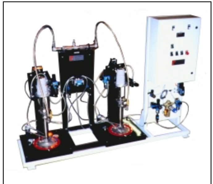
Dual five gallon single-post material supply pumps. An optional Robotics, Inc. pressure monitoring system (right) is integrated with this pumping system.