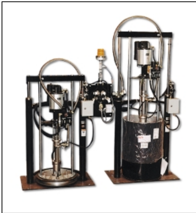
Dual 55 gallon two-post material supply pumps with automatic crossover